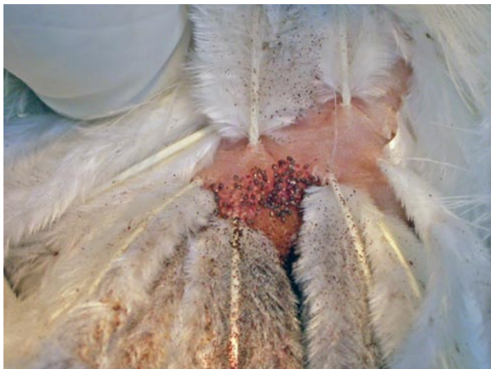
Figure 4. Northern fowl mites feeding on poultry.

A chicken mite can complete its life cycle in as few as 7 days. Adult females lay small groups of eggs in the environment surrounding their avian host. Eggs hatch in approximately 2 days, and the hatched larvae molt in 1 to 2 days without feeding. At all other life stages, this mite feeds on blood. Adult chicken mites can survive up to 34 weeks of starvation, so they are able to survive long periods where nests or poultry houses are unoccupied. This makes treatment of the entire poultry facility imperative if you want to control this pest.