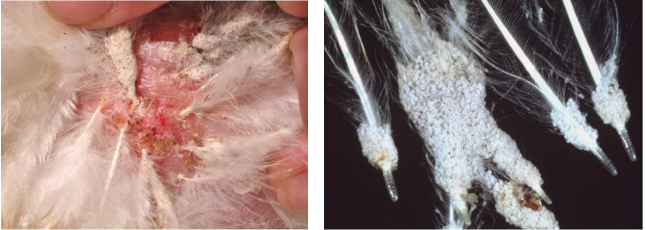
Figures 1 (left) and 2 (right). Egg clusters of the chicken body louse on base of vent feathers. Each egg is less than 1 mm long.

Birds should be checked for lice at least twice a month. Examination involves spreading the bird's feathers in the vent, breast, and thigh regions to look for egg clusters or feeding adults at the base of the feathers. The presence of some lice on most birds or of egg clusters on one or more birds is enough to indicate the need for treatment. Chemical treatment, if required, should be applied at 10- to 14-day intervals until the lice and nit numbers fall below this level. Louse eggs are resistant to insecticides, so a single insecticide treatment may not be sufficient to provide control. Louse eggs will subsequently hatch when the insecticide is no longer active. By re-treating at 7- to 10-day intervals, you can kill the newly hatched generation that survived the previous chemical treatment before they can grow to adulthood and lay additional eggs.